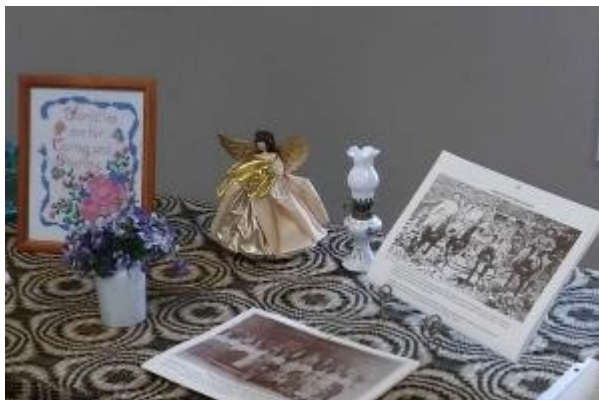
An interesting display of Family Heritage Artifacts were on display at the workshop.