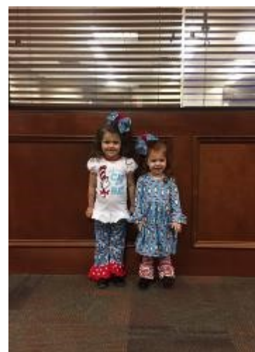
Two Storytime Guests in Cat in the Hat attire.

We had a wonderful week celebrating Dr. Seuss's March 2 nd birthday this year. We had a party, a movie marathon, and a visit from The Cat in the Hat himself. The Friends presented each family present with their own copy of The Cat in the Hat . Several parents have complimented the programs and are very grateful to FOUCL for providing the books at the March 5th storytime.