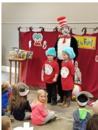
Thing 1 and Thing 2 with The Cat in the Hat.

We had a wonderful week celebrating Dr. Seuss's March 2 nd birthday this year. We had a party, a movie marathon, and a visit from The Cat in the Hat himself. The Friends presented each family present with their own copy of The Cat in the Hat . Several parents have complimented the programs and are very grateful to FOUCL for providing the books at the March 5th storytime.