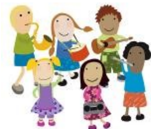
Musical Kids EPS PNG JPEG

If you have a chance, please take a moment and check out the MRLS website ( www.mountainregionallibrary.org ). You will find many great things going on throughout the library system. We would welcome your feedback and any suggestions you might have.