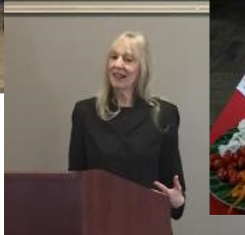
Attendees get great tips from our knowledgeable speaker!