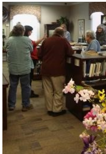
Workshop attendees discover the resources available in the Heritage Room at the library.